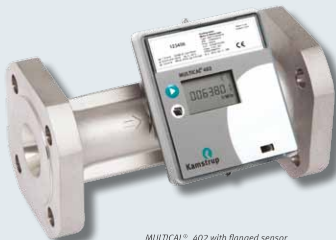
MULTICAL® 402 with flanged sensor