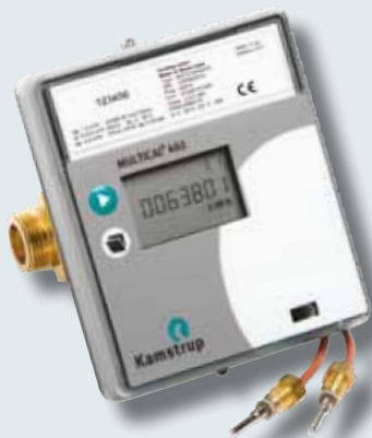
MULTICAL® 402 with threaded sensor

Accuracy class 2 or 3, wide dynamic range ( q_p/q_i 100:1), and the high permanent overload capability ( q_s/q_p 2:1) are standard features.